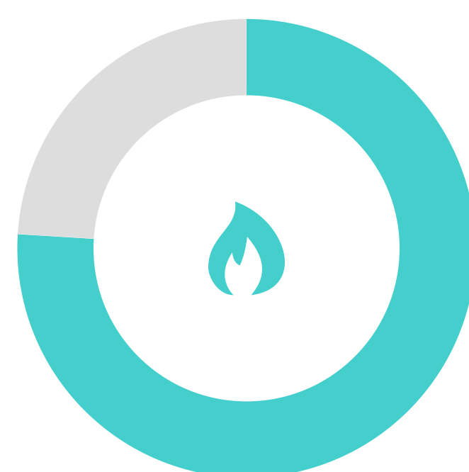
76% of Montana homes use fossil fuels for heating. 2